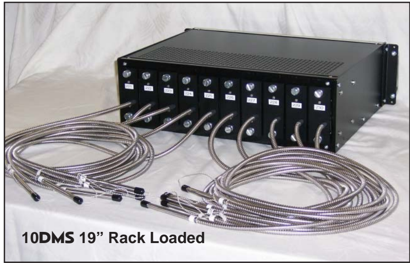
10DMS 19" Rack Loaded